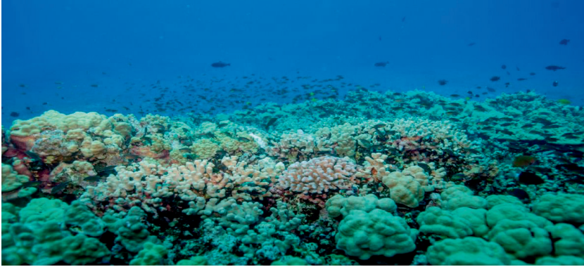
FIGURE 3. Healthy coral colony. Coral colony started as a single polyp growing only a few centimeters a year.

understand that their actions have negative impacts on fragile ecosystems such as the reefs. Educated local residents can help by educating others, but the situation must be approached in a stern but nonthreatening manner. Friends and acquaintances have had unpleasant encounters with locals when they unintentionally damage reefs and local or sacred lands. The anger and yelling make them inclined to continue with the harmful behaviors, whereas those who are treated kindly and softly informed of their ignorance are quick to change their ways and want to become better. Helping people understand the consequences of their actions can help people change the way they treat these living ancient artifacts.