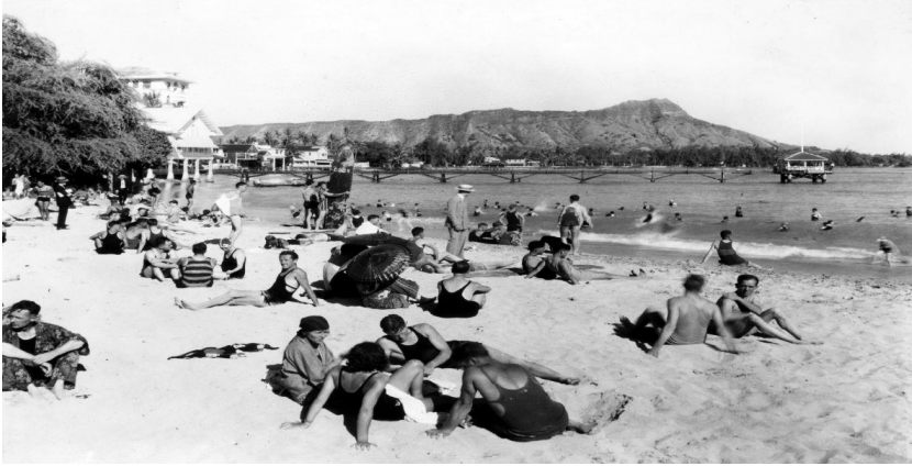
FIGURE 1. Shore of Waikiki.